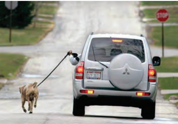
Physical activity has almost been completely designed out of everyday life.

Urban design can be employed to create an active community.