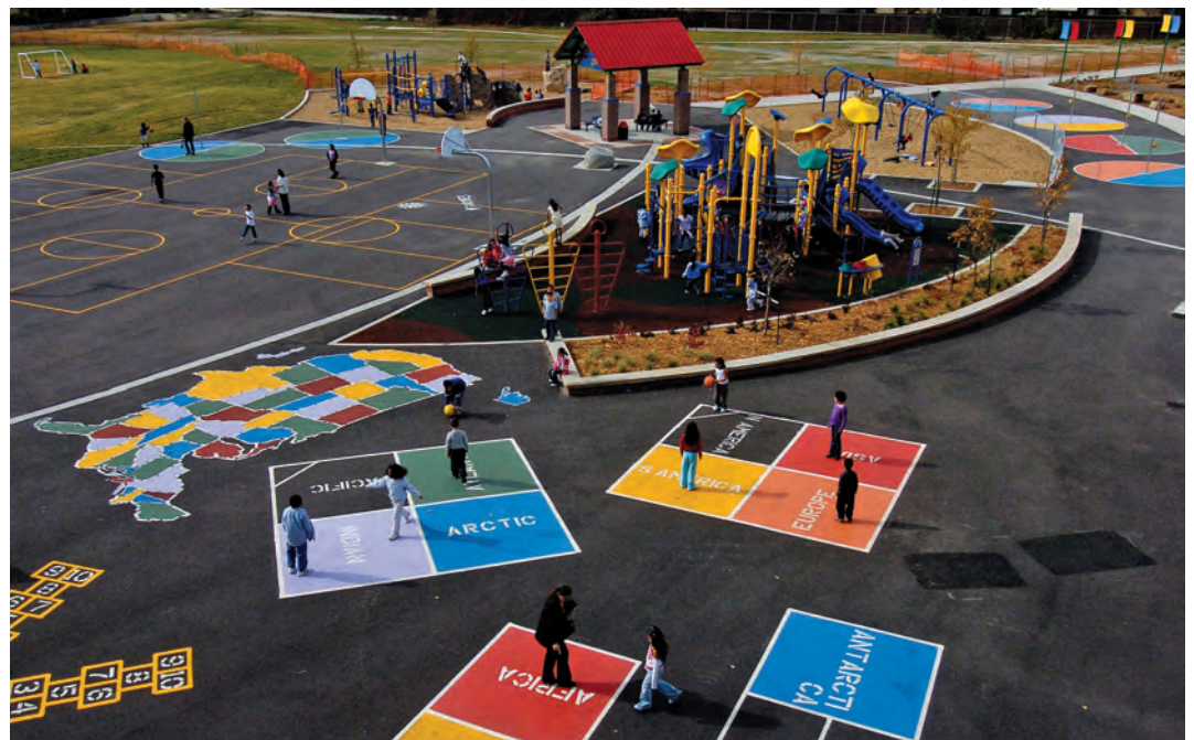
Adding colors to playgrounds encourages activity.

Access to safe neighborhood play spaces for children is associated with higher rates of physical activity and lower rates of time spent watching television and