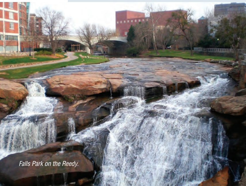
Falls Park on the Reedy.

Greenville leaders often emphasize that success can be found in the special attributes of a community. Although that particular attribute is different in each city—in Greenville’s case, it was a 60-foot waterfall located right off Main Street—capitalizing on those existing assets is crucial for economic development.